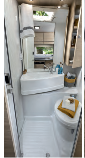
New bathroom with swivel partition.