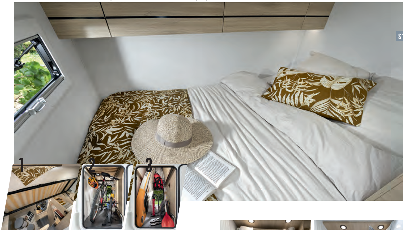
Foldable "butterfly" bed to access storage units or increase the size of the garage.