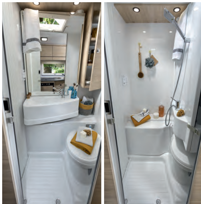
New bathroom with swivel partition.